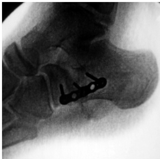
Fig. 1. Intraoperative radiograph. Alignment of relative lengths of the talus and calcaneus

A narrow elevator was used to find the gap between the middle and anterior facets of the os calcis, dissect the periosteum along a line that starts 1.5 cm proximal to the line of the calcaneocuboid joint and continues into the specified gap. The osteotomy plane was oriented along this line, which should run in the direction from the proximal-lateral to distal-medial edge of the os calcis. After completion of the osteotomy, Steinman pins were inserted into the os calcis fragments at a right angle, on which a distractor was mounted, with which the required level of correction was set. This level of correction was controlled radio-