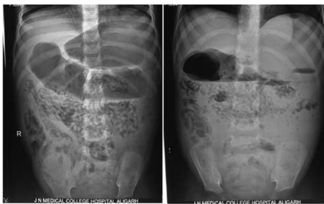
Fig. 2. X-ray abdomen (supine and erect) of a child of 5 years of age with history worms infestation showing dilated small bowel loops and stomach gas shadow showing air fluid level with mottled appearance in most of the loops

Imaging evaluation was done by x-ray abdomen-erect and supine views & abdominal sonography on SAMSUNG SONOACE R 7 equipped with 3-5 MHZ curvilinear and 5-12 MHZ linear probe.